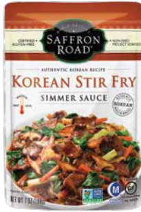
Korean Stir Fry