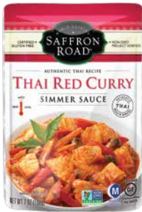
Thai Red Curry