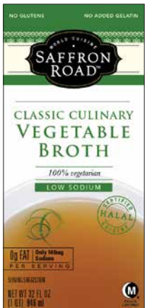
Classic Culinary Vegetable Broth LOW SODIUM